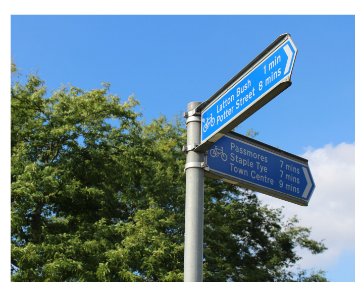
So many places to explore!