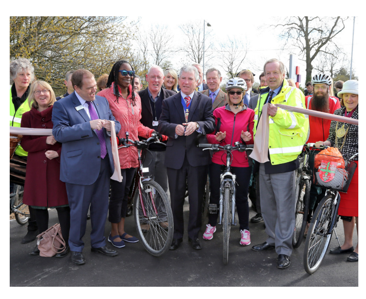
Strong political support for cycling across Essex