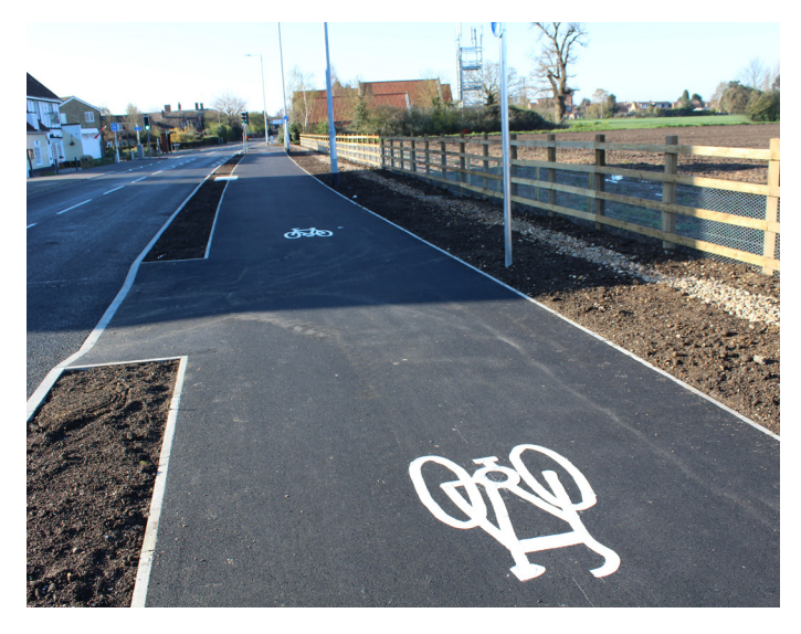
High quality cycle routes across Essex

As part of the Essex Cycling Strategy, we are also developing a network of Everyday Cycling Ambassadors across the County to help promote cycling. Our Ambassadors are inspirational everyday cyclists from a range of backgrounds that have an interest in helping double the number of people cycling in Essex. We want Essex residents to be inspired by everyday people and to see that cycling is a normal, enjoyable and everyday activity.